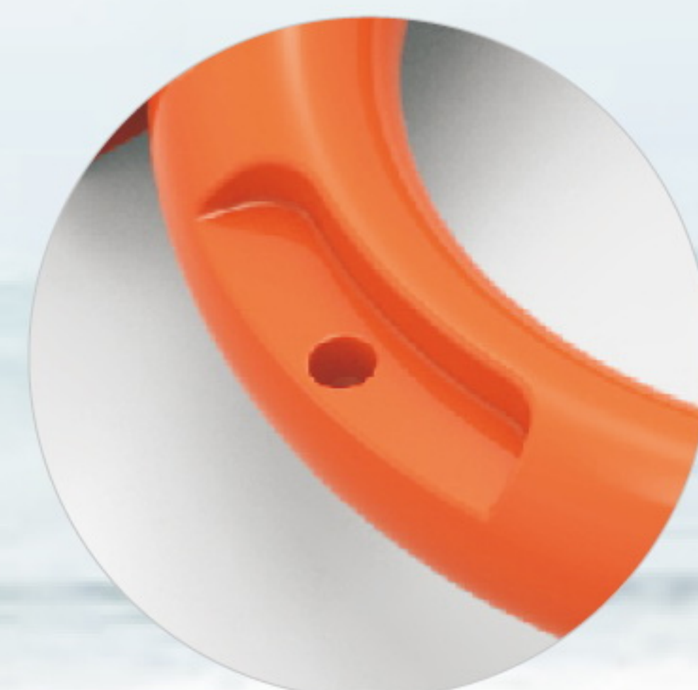
Hole for rope