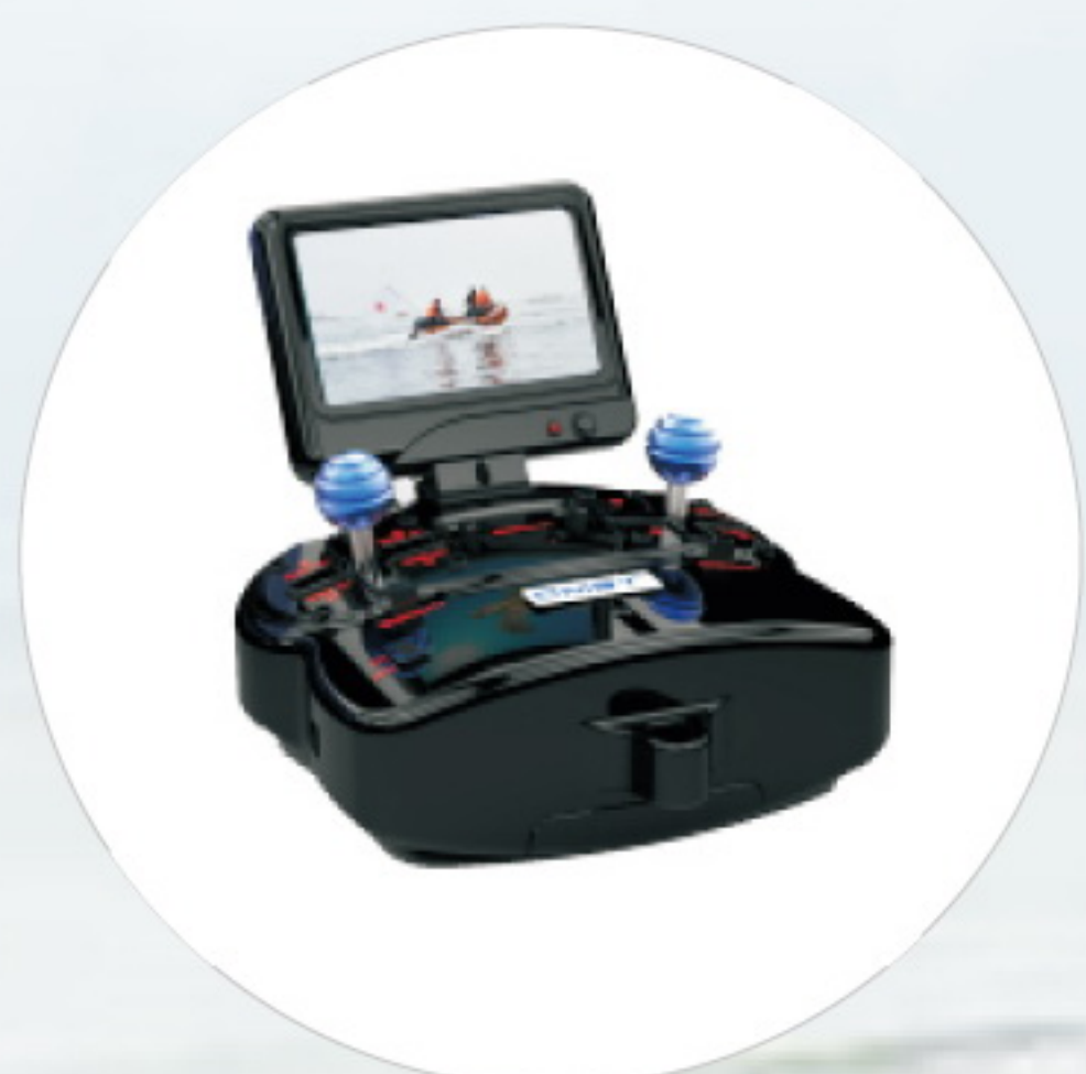
5.8G/2.4G wireless video controlling system