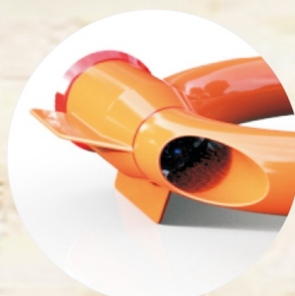
Outfall for water